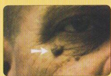
Skin Tag Before

This month , we see the introduction of the Clinical Skin Clear , a system expertly designed to remove minor skin irregularities, such as clogged pores, fibroma simplex, skin tags, hyperpigmented lesions, spider naevi, cholesterol deposits, milia, acne pimples and telangiectasis. This treatment, administered at Raptcha'u by Carolyn from Proskin Clinic , works non-invasively using combined radio and high frequency technologies; liquids attracted to heat are released via various sized probes to eradicate these unwanted irregularities. This process is quick and does not damage or harm surrounding tissue, with minimal discomfort and a short healing time, depending on the size and type of the tissue being treated. Costs are estimated at $105 for red facial capillaries or multiple lesions, and $50-$150 for small to large individual spots.