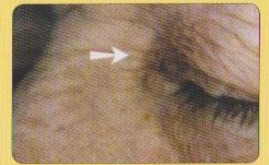
Cholesterol Deposit After