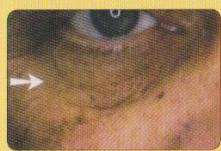
Skin Tag After